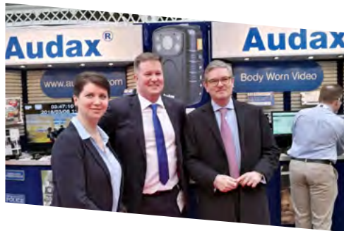
Audax® with Sir Julian King, European Commissioner for the Security Union and our EU H2020 EASME Project Officer