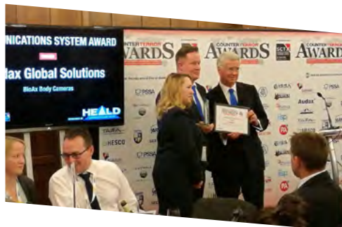
Audax® receives award from Sir Michael Fallon at the Counter Terror Awards